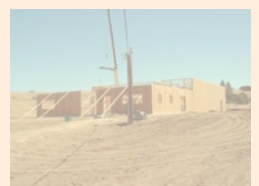
High Prairie Fire Station, Under

“completeness of the files was awesome. That was the best monitoring I've ever participated in.” -Beverly Kupperman, OECDD