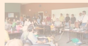
GTA Member Meeting

Under the direction of the FACT Advisory committee, MCEDD conducted research of regional technology and non-technology businesses including a web survey, interviews, and selection of possible technology courses. As a result of this research, the assessment indicated that a workforce need in these areas does exist, but that a career-focused path in the manner outlined through the survey would not achieve as much as individual classes. MCEDD then worked with the College to change the direction of the assessment to focus on class options that would best meet the defined technology workforce need. Introductory and intermediate classes in computer programming and scripting, network design and administration and computer hardware setup and administration were most desired among the businesses that responded to inquiries.