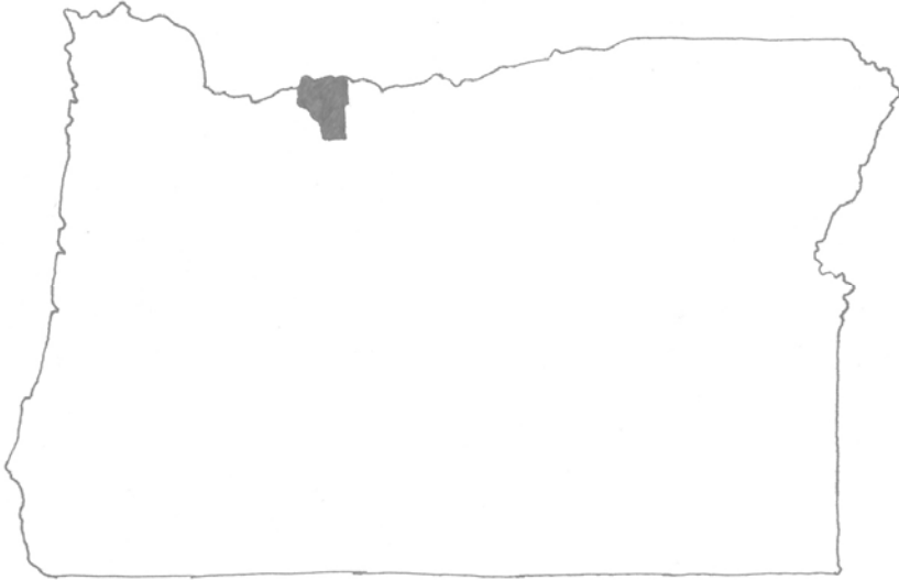
Map of Oregon

Hood River County is highlighted on this map of Oregon. Portland is the nearest major metropolitan area to Hood River County. Hood River County's main access is via Interstate 84.